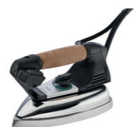
Dotazione ferro da stiro mod. EOS (fornito standard) Supplied with EOS iron (standard equipment)