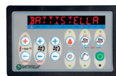
Console comandi Control panel