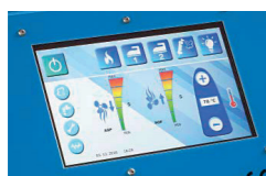
Touch screen Touch screen