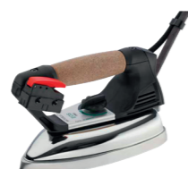
Ferro da stiro mod. EOS PRO (fornito standard) Supplied with EOS PRO iron (standard equipment)