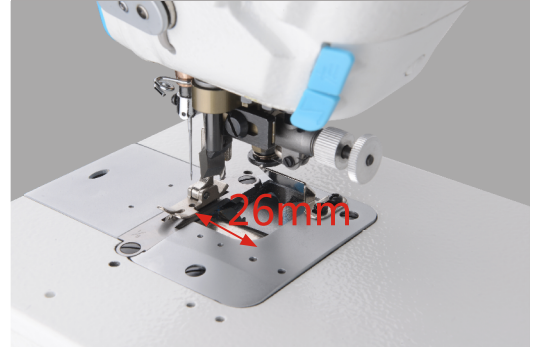
26mm Dust Collector Space