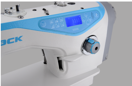
Integrated, Easy to Install