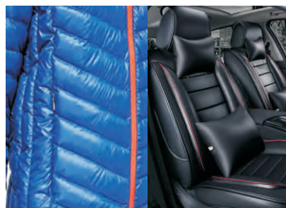
Wide range of application

Automatic sewing, intelligent and high efficiency