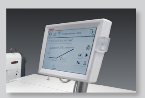
Touch control panel with many service functions and different user levels

New • No. 95-744 852-90 Short parts stacker for children's jackets and vests