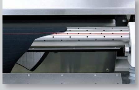
Laser beam for exact placing and positioning of the material