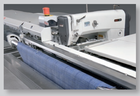
Modern high-speed sewing head PFAFF 2083