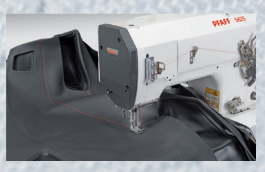
Single-needle fancy seams on dash boards