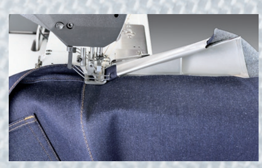
Attaching and top-stitching of jeans waistbands

4-needle top-stitching work on jeans trousers