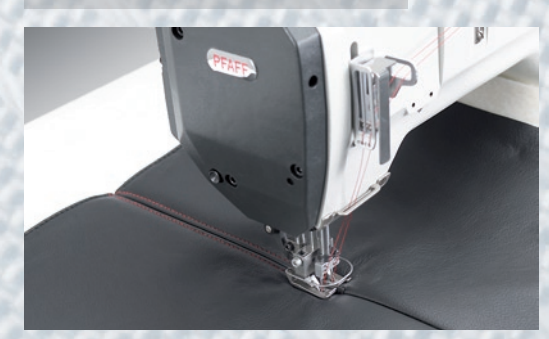
Double-needle top-stitching work on seat plates