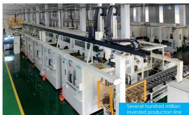
Several hundred million invested production line