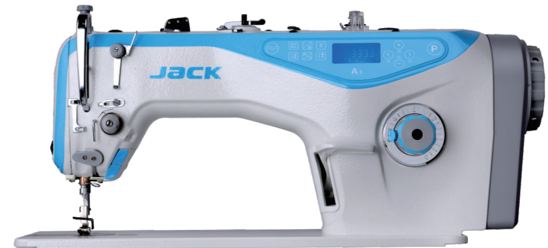
COMPUTERIZED LOCKSTITCH SEWING MACHINE A3