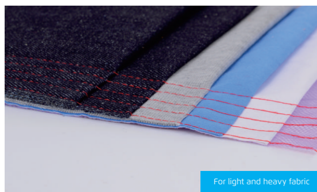
For light and heavy fabric