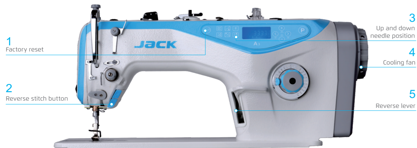
German Design, Unique and Perfect