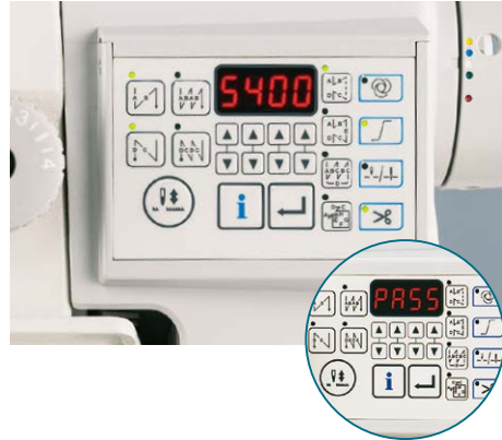
Provided with a password lock function

Compared with conventional V-belt driven sewing machines, sewing machines driven by direct drive motors save more than 13% of power consumption.