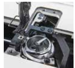
LU-1520NCS-7 (Remaining-thread length : Less than 5mm)